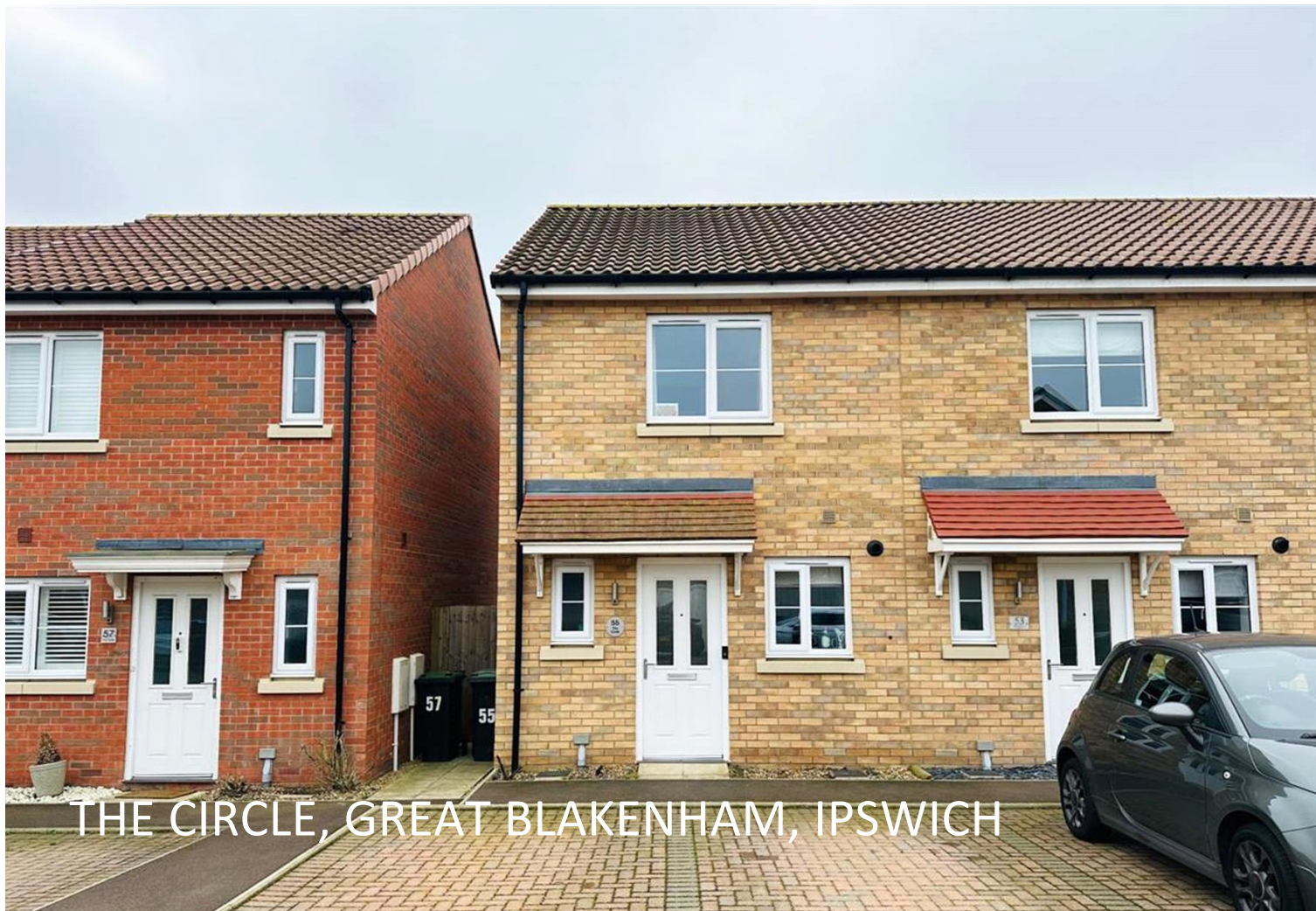
THE CIRCLE, GREAT BLAKENHAM, IPSWICH