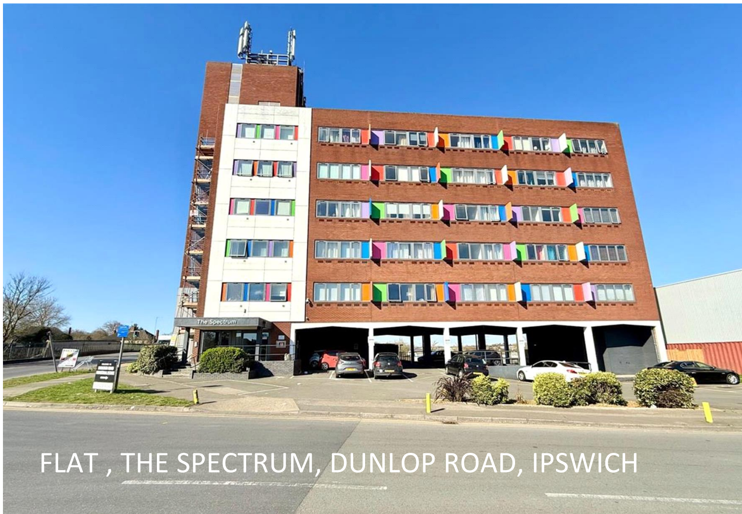
FLAT , THE SPECTRUM, DUNLOP ROAD, IPSWICH