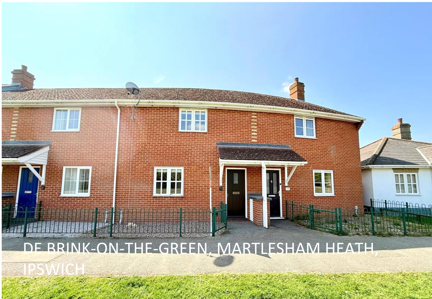
DE BRINK-ON-THE-GREEN, MARTLESHAM HEATH, IPSWICH