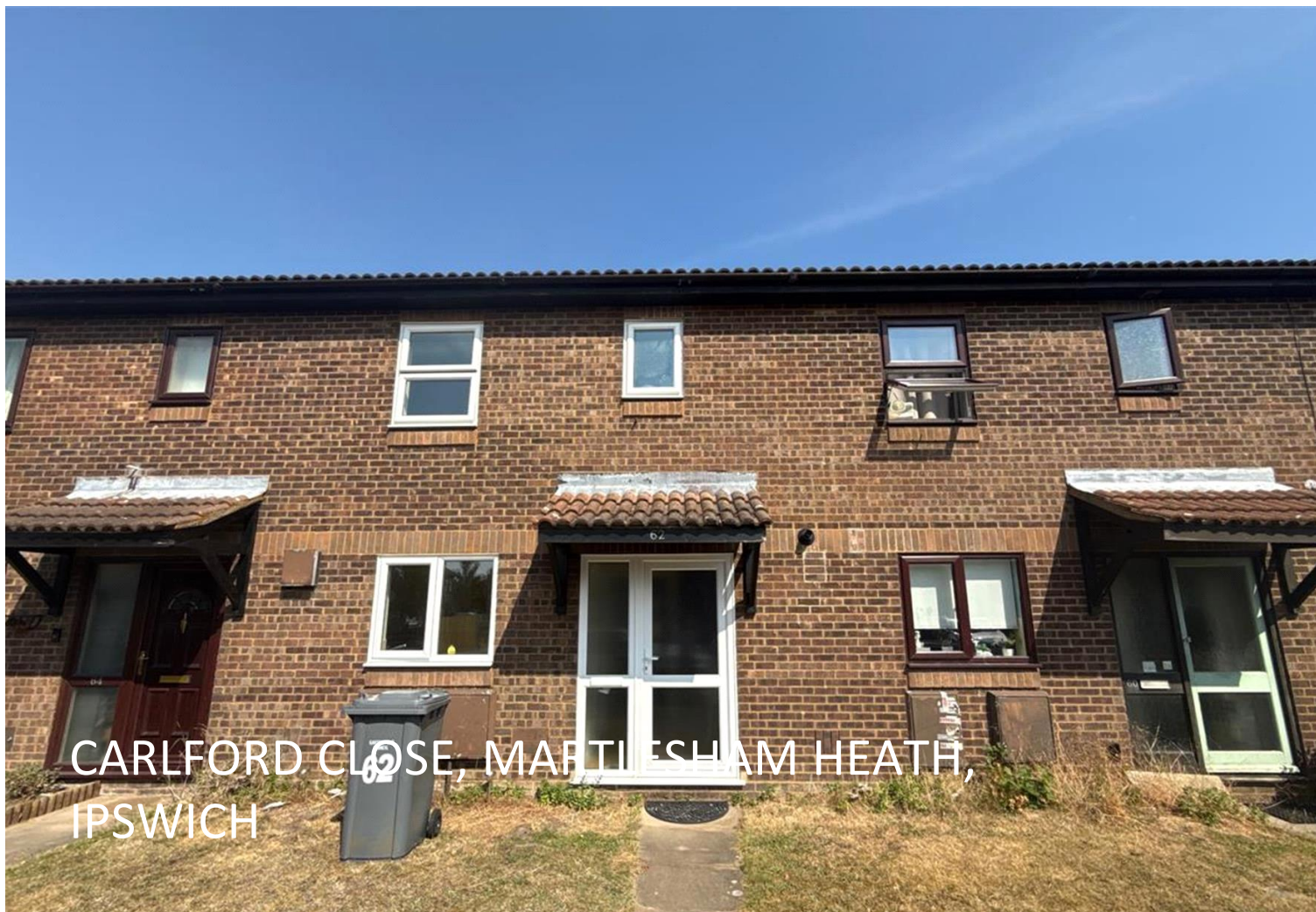
CARLFORD CLOSE, MARTLESHAM HEATH, IPSWICH

2 Bed Terrace, Martlesham Heath, 1 min drive to the A12, and a 7-8 mins walk to the village square,