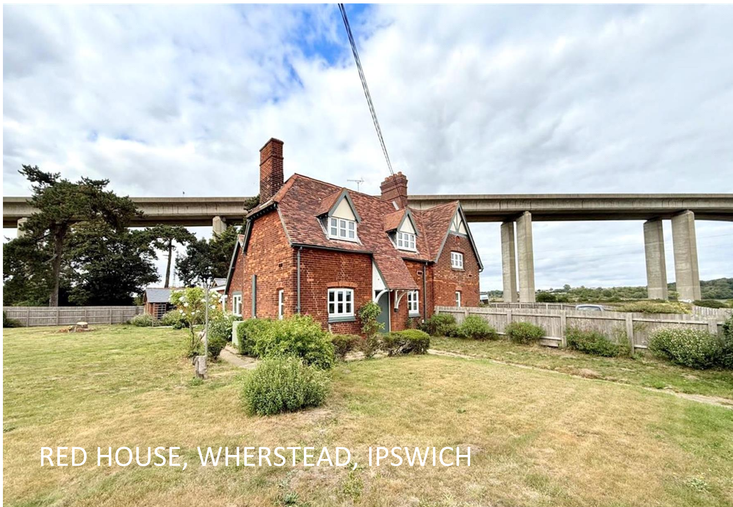
RED HOUSE, WHERSTEAD, IPSWICH

2/3 Bed Semi Detached, Wherstead, Ipswich,