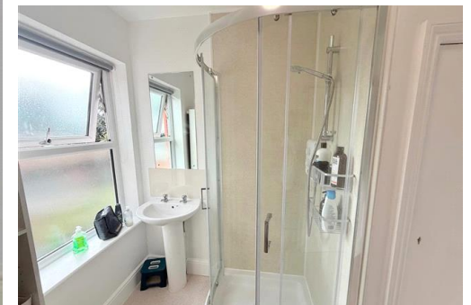
1 Bed Double Room (HMO - 1 Adult) Hatfield Road, Ipswich

£550 pcm 1 Bed Double Room (HMO - 1 Adult) Hatfield Road, Ipswich