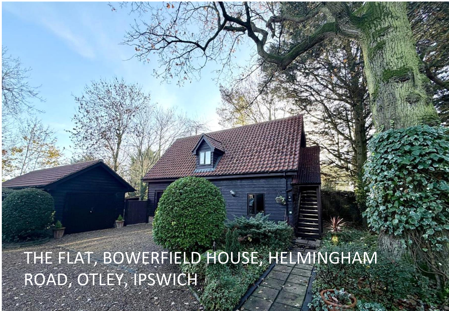
THE FLAT, BOWERFIELD HOUSE, HELMINGHAM ROAD, OTLEY, IPSWICH