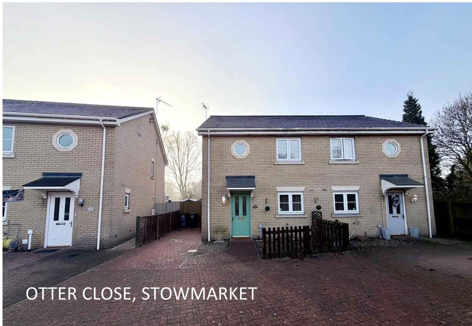
OTTER CLOSE, STOWMARKET