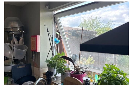
Top Floor Room - Alexandra Road, Colchester

£520 pcm Top Floor Room - Alexandra Road, Colchester