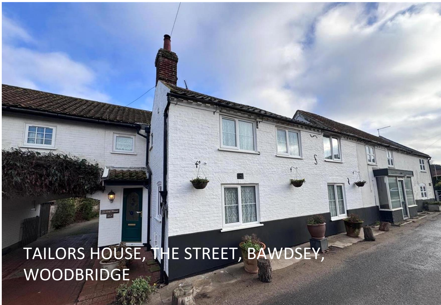
TAILORS HOUSE, THE STREET, BAWDSEY, WOODBIDGE