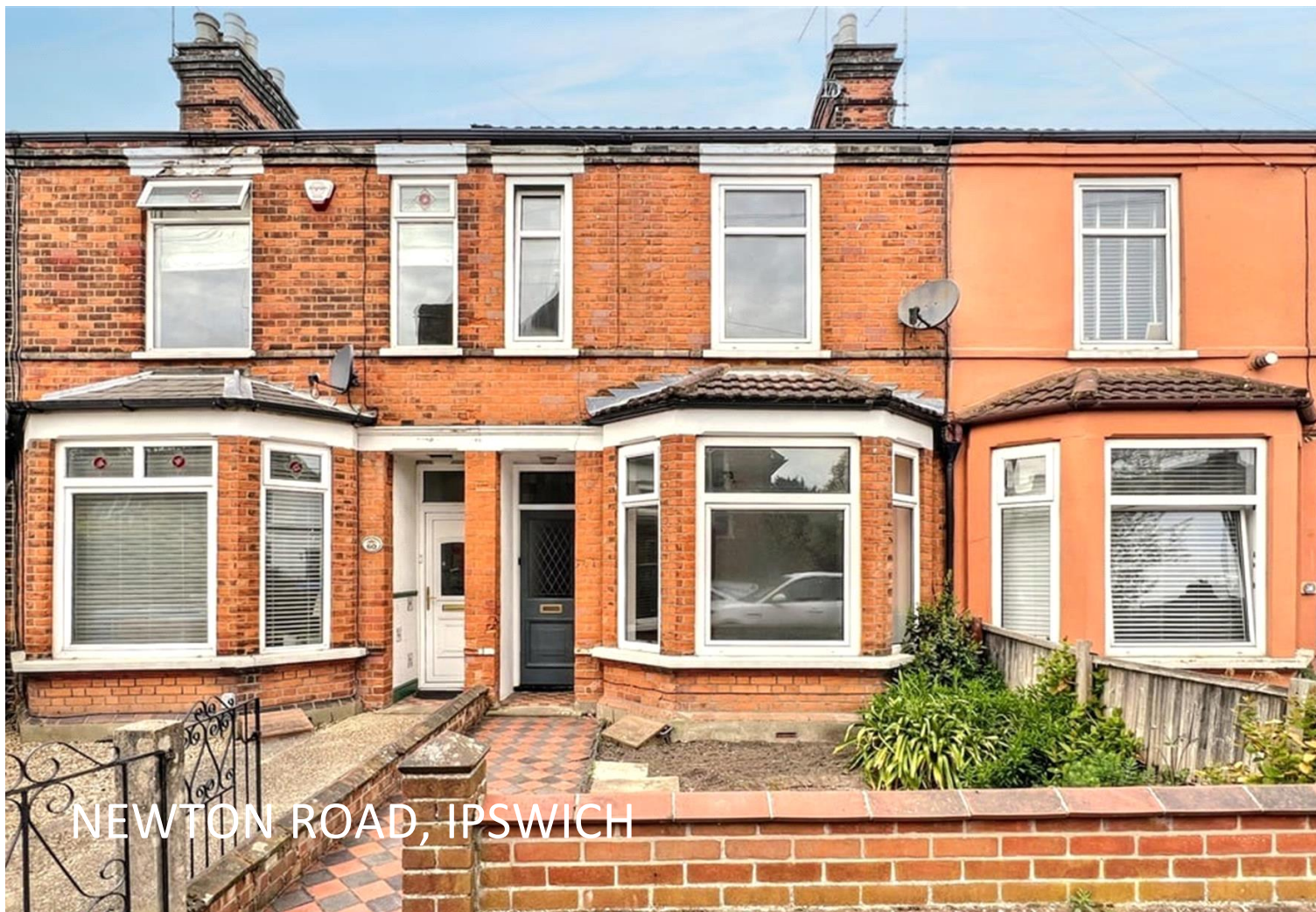
3 Bed Mid Terrace, Newton Road - East Ipswich

£1,150 pcm 3 Bed Mid Terrace, Newton Road - East Ipswich