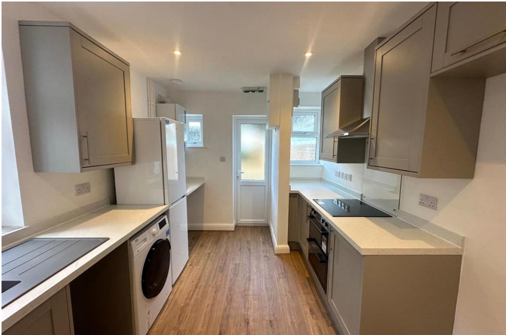
Kitchen Rear Garden