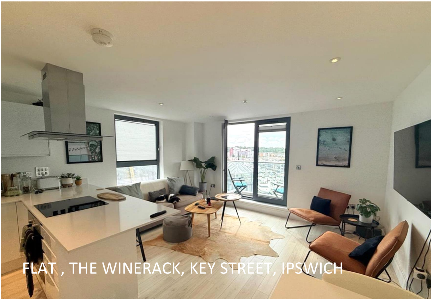
FLAT , THE WINERACK, KEY STREET, IPSWICH